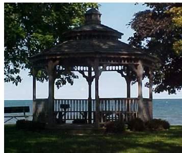
Bicentennial Park at Lake Ontario