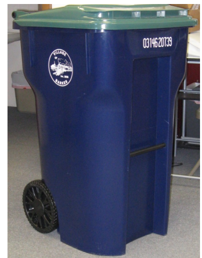
Our New Recycling Carts!